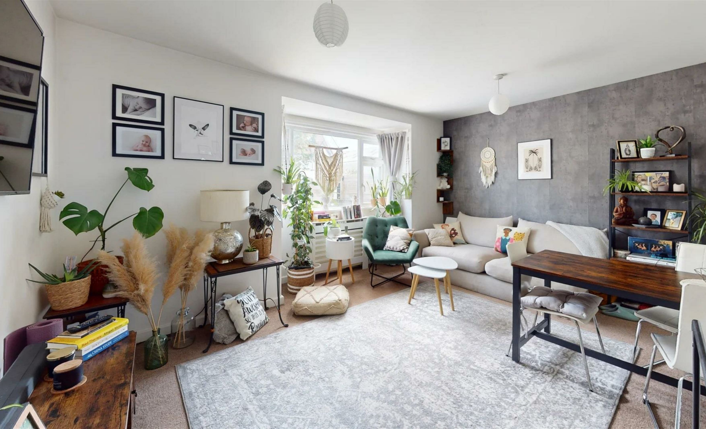
Qu'appelle Apartments, Willow Grove, St Clement, Jersey, JE2 6QB £725,000